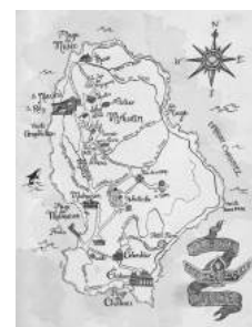
18" by 24" poster