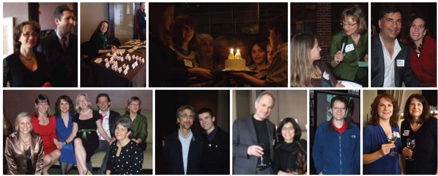
Bistro Canoe photos continued on the top and bottom of next page...

Merci mille fois to all who supported the Canoe Island French Camp scholarship fund through their Bistro Canoe attendance and donations.