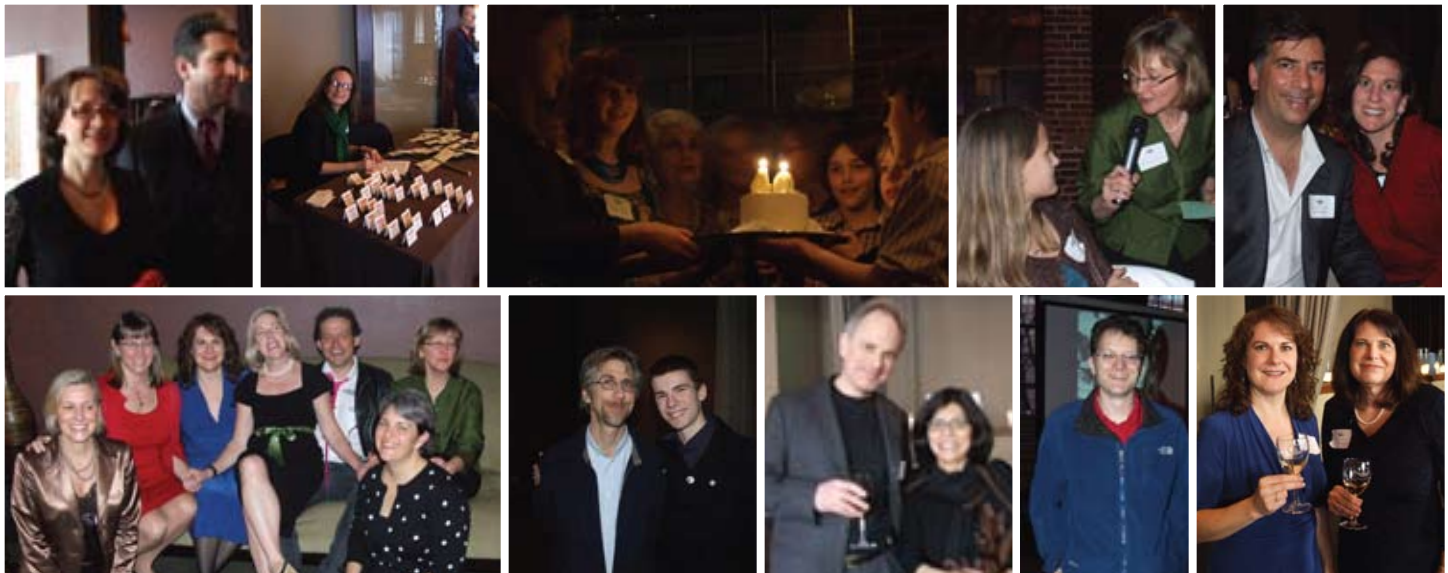
Bistro Canoe photos continued on the top and bottom of next page...

Merci mille fois to all who supported the Canoe Island French Camp scholarship fund through their Bistro Canoe attendance and donations.