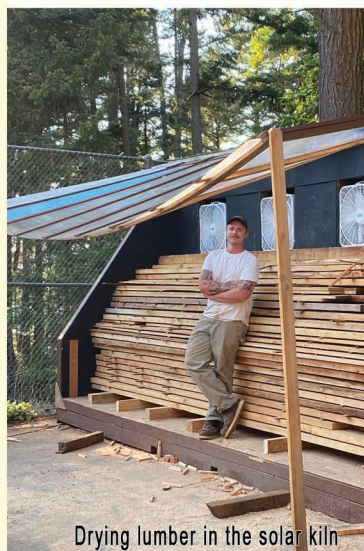
Drying lumber in the solar kiln