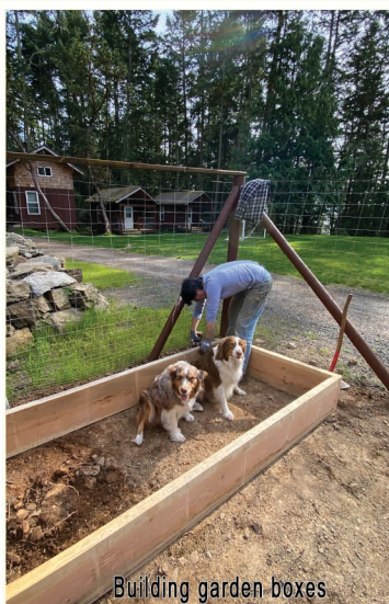
Building garden boxes