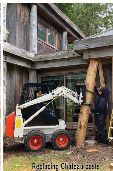
Replacing Château posts